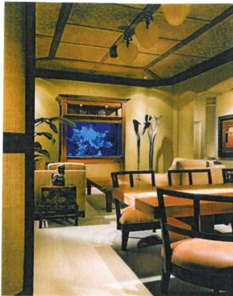
Left: First Place in Residential, Singular Space, went to Interior Motives for this tropical-inspired design.

See "Residential Walk-Through" in this issue.