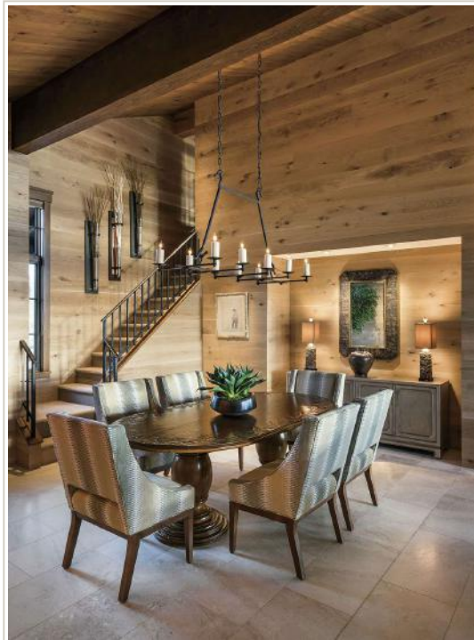
The home's white oak tongue-and-groove paneling creates a lodgelike aesthetic with a contemporary edge. Hand-forged railings and a custom wrought-iron chandelier add rustic touches.

While the homeowners wanted the house to have a lodgelike feeling, they sought to avoid a traditional cabin aesthetic. "You have to be able to look at the lot and see the house that's in it," says Naus. "In the choices the homeowners made, particularly with wood and stone, there is a nod to a mountain cabin, but those materials were used in a contemporary way to achieve a rustic, organic feel."