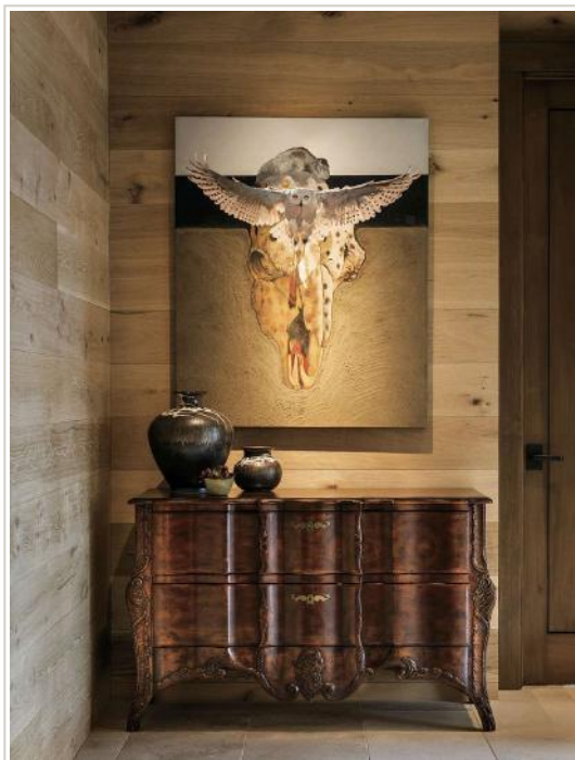
A stately antique bureau resides in a hallway beneath the painting "Sun Altar" by Ron Faner.

The great room includes a peaked ceiling, 8-foot-long horizontal fireplace, glass wall with accordion doors and a large deck that welcomes mountain breezes and celebrates that jaw-dropping view. Whether used for reading, watching TV or simply reveling in the natural splendor just outside, the room is the couple's favorite spot for relaxing or enjoying the company of friends. After sunset, twinkling lights in the valley below present their own dazzling show.