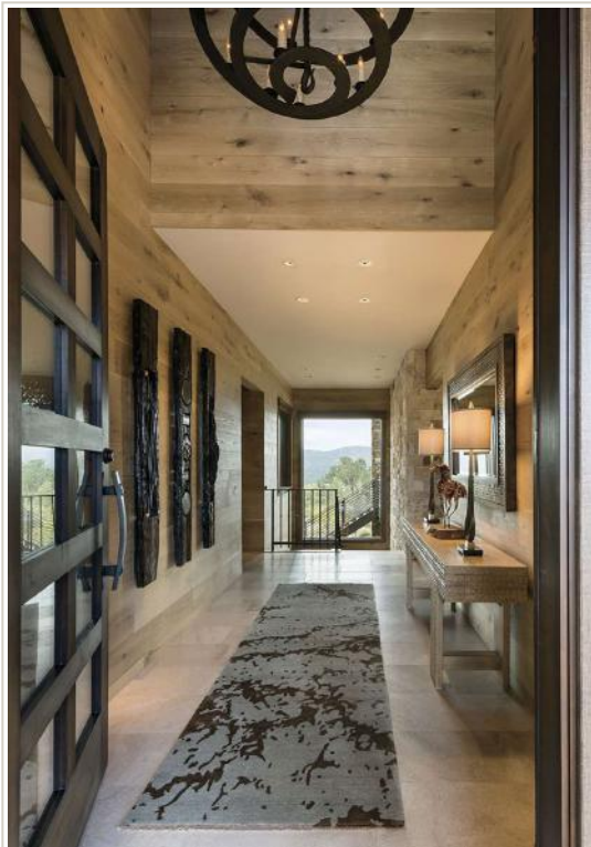
The home's entryway includes a view of surrounding hills and the San Francisco Peaks in Flagstaff. The stairs at the far end lead to the lower level, which includes the game room, bar, wine cellar and guest bedrooms.

For the interiors, Brooks set the stage with the flooring, using limestone with a brushed finish in the main floor's primary living spaces, such as the great room, kitchen and dining room, and reclaimed carbonized oak in the lower level, which includes a game room and walk-out deck. The homeowners chose to carpet only the bedrooms, adding an element of coziness for chilly winter nights.